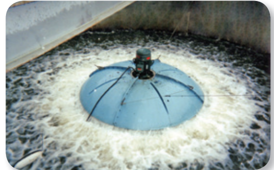
Aqua-Jet II® Aerator in operation.