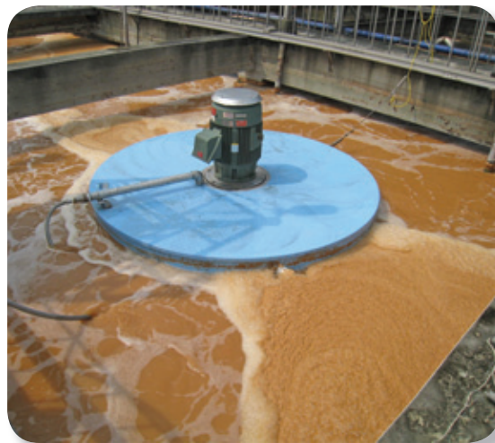
OxyMix® Pure Oxygen Mixer in operation.