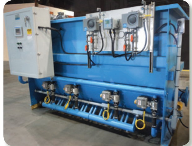
Overview of a 10-disk AquaMiniDisk® unit.