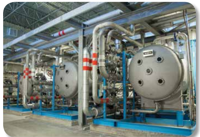
3900 PPD (12%) Generators at Wylie, TX

The system went online in 2014 and has consistently met the stringent treatment objectives while also gaining its recognition as the largest drinking water plant in the world utilizing ozone treatment.