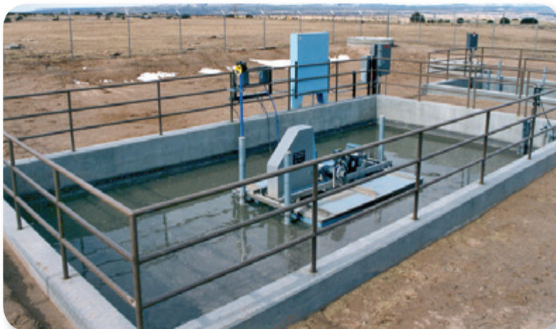
Overview of the AquaCAM-D® unit in a SBR reactor.