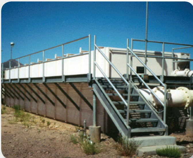
AquaABF® package filters are ideal for both municipal and industrial water or wastewater treatment applications.

AquaABF package filters are available in a variety of sizes, ranging from 4 ft. x 8 ft. (1.2 m x 2.4 m) to 9 ft. x 40 ft. (2.7 m x 12.2m), and are available in both painted steel and stainless steel.