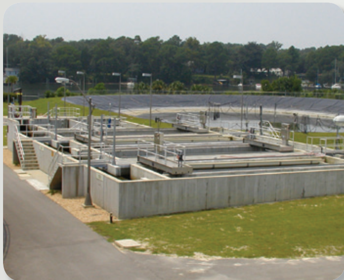
Four AquaABF® concrete filters installed as part of this plant's upgrade to meet required effluent TSS and phosphorus levels.

AquaABF concrete filters are available in standard widths of 6, 9, 12.5, and 16 ft. (1.8, 2.7, 3.8 and 4.9 m), offering site adaptability and cost efficiency.